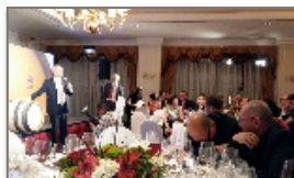
IN & AROUND CTIS RECENT NEWS PG. 3