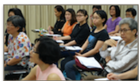
TOB WORKSHOP PHOTOS PG. 2

OUR IN-HOUSE NEWSLETTER FEATURES MESSAGE FROM OUR RECTOR, ARTICLES, BOOK REVIEWS & NEWS OF INTEREST TWICE PER SEMESTER.